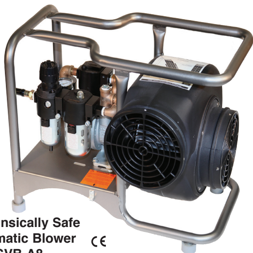
8" Intrinsic Safe Pneumatic Blower SVB-A8