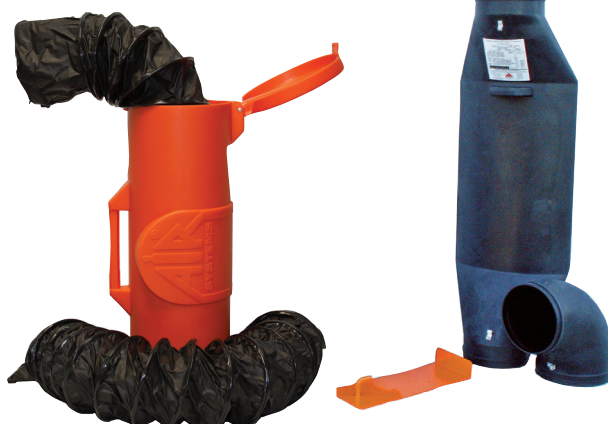
8" Conductive Blower Kit SV-CUPCND